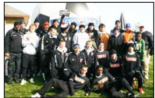
GOOD SPORTS—Members of the boys soccer team celebrate their Sportsmanship Award at the state tournament.